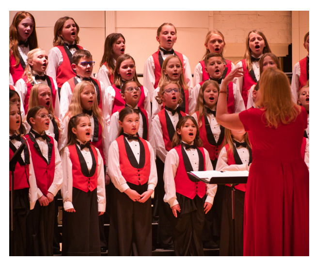
Performing with peers from across the area enhances singers' understanding of place in the community.

Community: a feeling of fellowship with others, as a result of sharing common attitudes, interests, and goals.