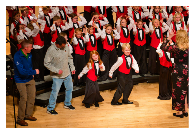
Introducing young people to the joy of singing and fostering a lifelong love of music!

These are just a few of the projects we're working on, but hopefully it gives you an idea how your support is helping to move our mission forward. I invite you to take a moment to savor every-