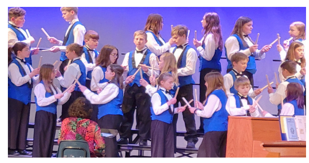
"CDCC has made me a better performer and I've made new friends. It also made me love music even more."

--Launched our first-ever online parent portal! This management system is designed specifically for choral programs like ours. With this new technology, we are streamlining processes and improving communication with our singers and families. As with anything new, there have been a few bumps along the way, but our choir families are absolutely amazing and have worked with us to make the roll-out hugely successful.