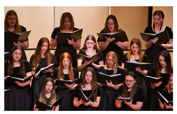
"We all come from different schools and music programs...it is really special to come together just for the sake of making music.

When I look back over the past six months and all the changes that have taken place here at the choir, it kind of takes my breath away! If you had told me last Christmas that this is where we'd be a short 12 months later, I wouldn't have believed you! But here we are, and I honestly can't think of anyone I'd rather have with me on this journey than YOU!!