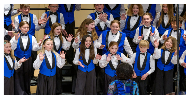
"Choir has given me the chance to make friends while doing something I truly enjoy. It brings me a lot of joy to sing with CDCC."

We kicked off our 26th season in September and it's been a whirlwind of activity since. With only a few weeks of rehearsal under their belts, all five choirs performed brilliantly at our free public concert at Kirkwood Mall. We continued the celebration the following week as Kantorei and Bel Canto performed during our 1st ever Family Fun Night at the Bismarck Event Center.