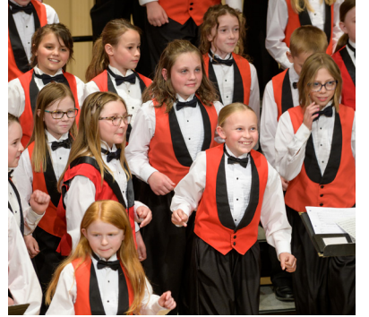
"CDCC brings so much joy to not only me, but my family."

...is Joy! Lots of Joy!! Thanks for giving children a place to find their joy and a way to share it with others!