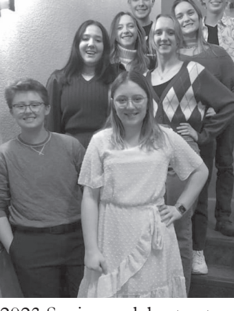
2023 Seniors celebrate at our Senior Recognition Dinner