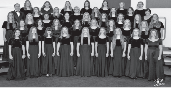
"CDCC has given me the opportunity to surround myself with like-minded people who make singing a priority."

You make moments like this possible!! Thank you!